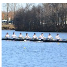
Princeton Rowing Club