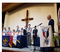
Troop 40 Eagle Scout