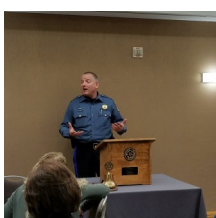
West Windsor Police