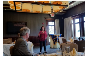
Upcoming service projects